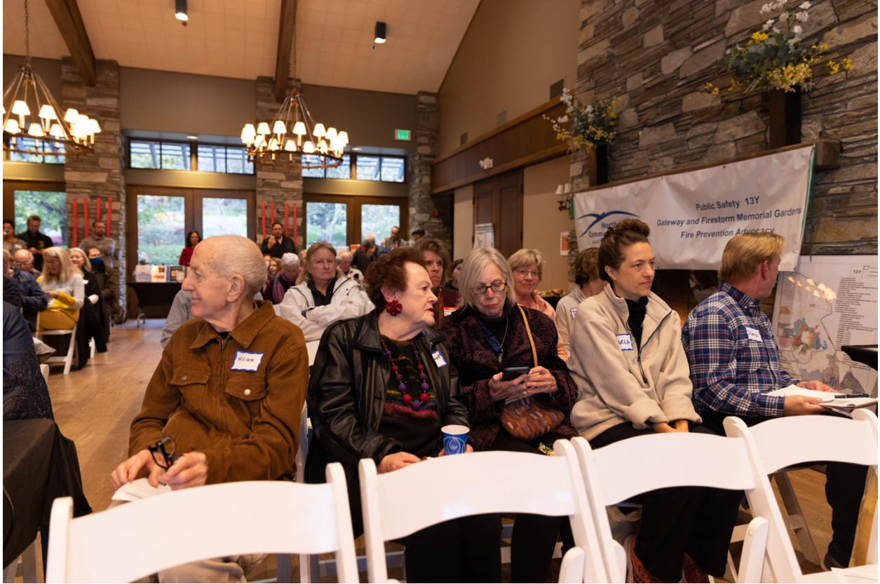
Here are a few of the many meeting attendees waiting patiently for things to get underway.