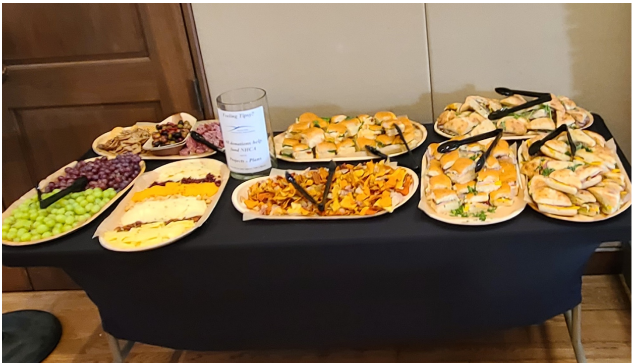
Some of the amazing food that awaited meeting attendees...