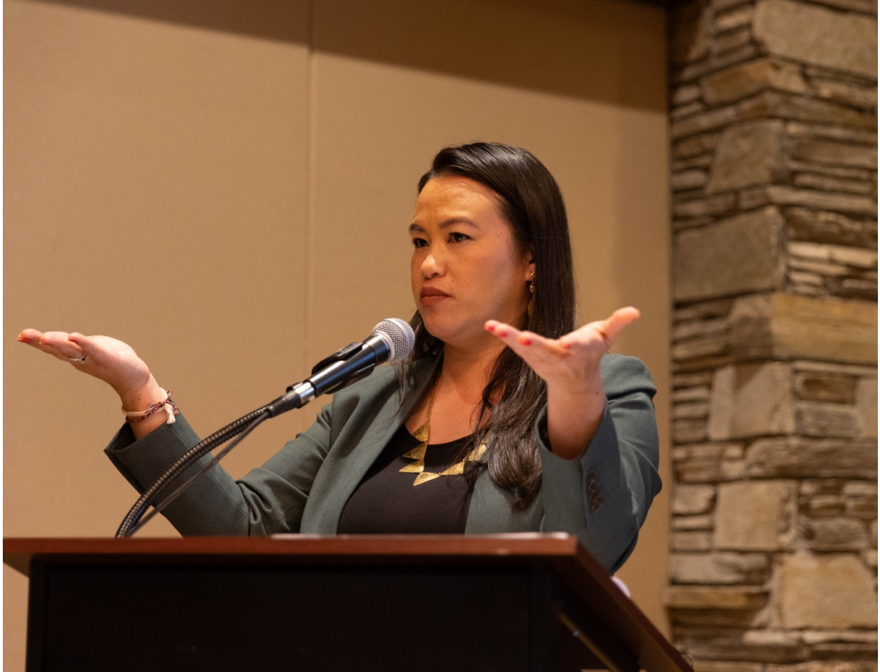
Oakland Mayor Sheng Thao discussed some of the challenges of balancing numerous priorities in an era of constrained resources and finding the best path forward.